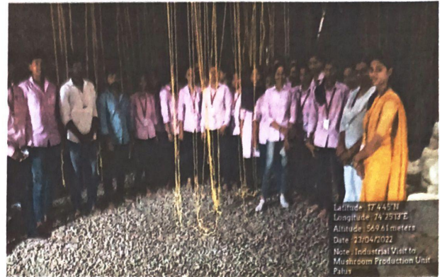
Production members, our staff and students