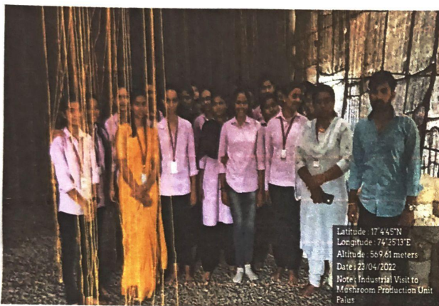
Students with staff and Production Manager